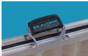
Ergonomically designed handles offer convenient carrying and a comfortable grip