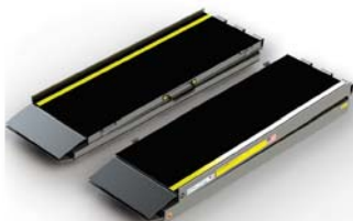
Separates for transport and storage