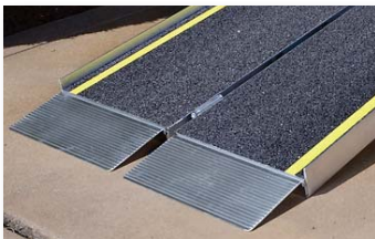
Bottom transition plates adjust to uneven terrain

Manufactured of welded aircraft-grade aluminum.